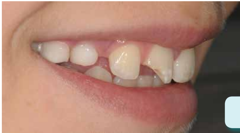
Figure 2: Preoperative close-up right lateral view.