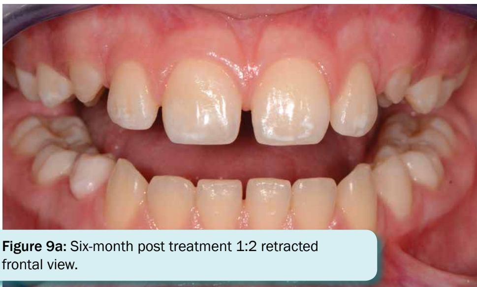
Figure 9a: Six-month post treatment 1:2 retracted frontal view.