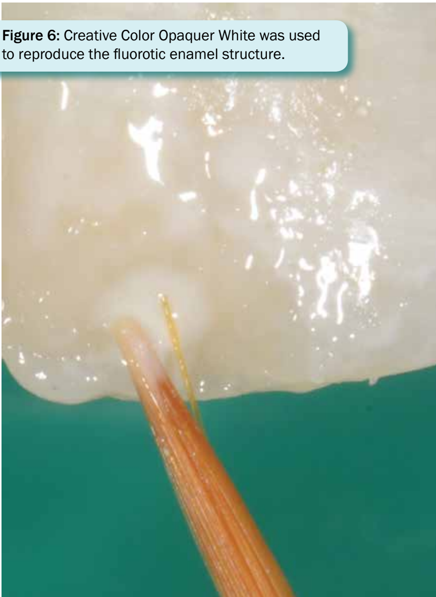
Figure 6: Creative Color Opaquer White was used to reproduce the fluorotic enamel structure.

CHARACTERIZING. An artist's brush (#1, Cosmedent) was used to apply patches and bands of Creative Color Opaquer White to reproduce the fluorotic enamel structure (Fig 6), as seen on tooth #9. The layer was light-cured for 20 seconds.