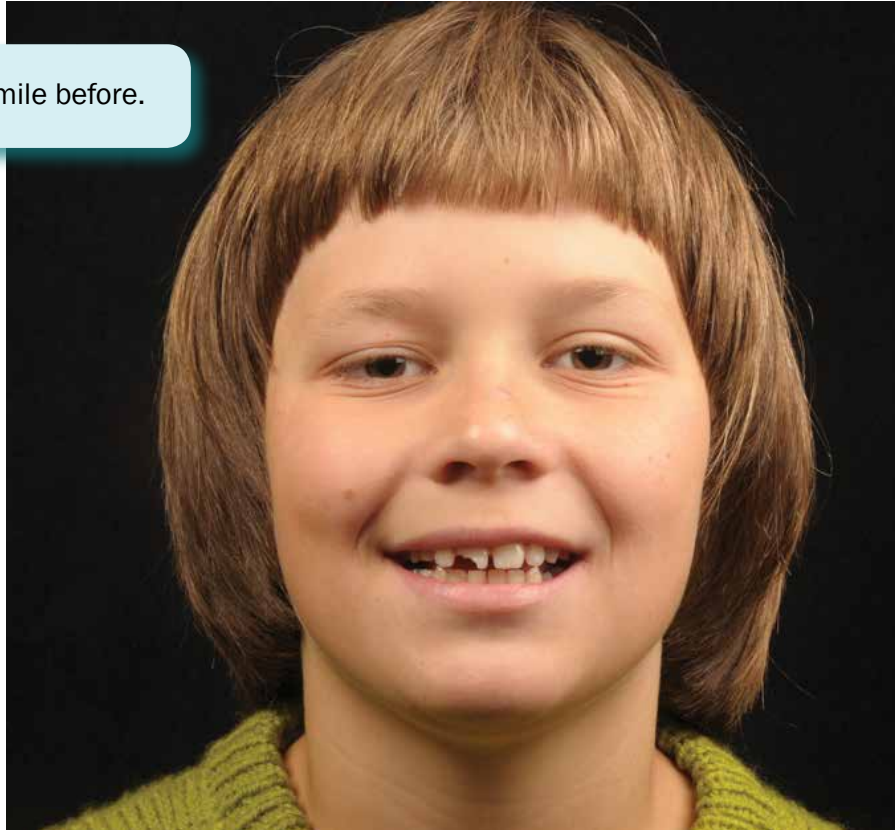
Figure 1 : Full-face smile before.

For young patients, Class IV direct resin restorations are an excellent treatment modality for restoring fractures of anterior teeth, especially central incisors. This case illustrates how direct composite resin can be used to provide an excellent and minimally invasive restoration that will clearly benefit the long-term biomechanical behavior of affected teeth.