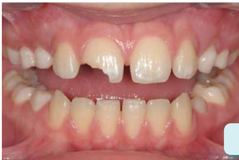
Figure 4: Preoperative 1:2 retracted frontal view.