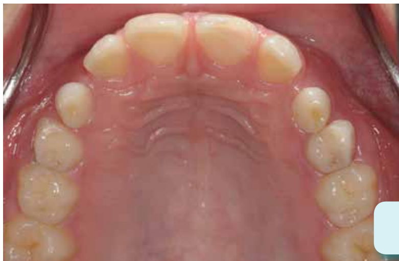
Figure 5: Preoperative 1:2 occlusal view.