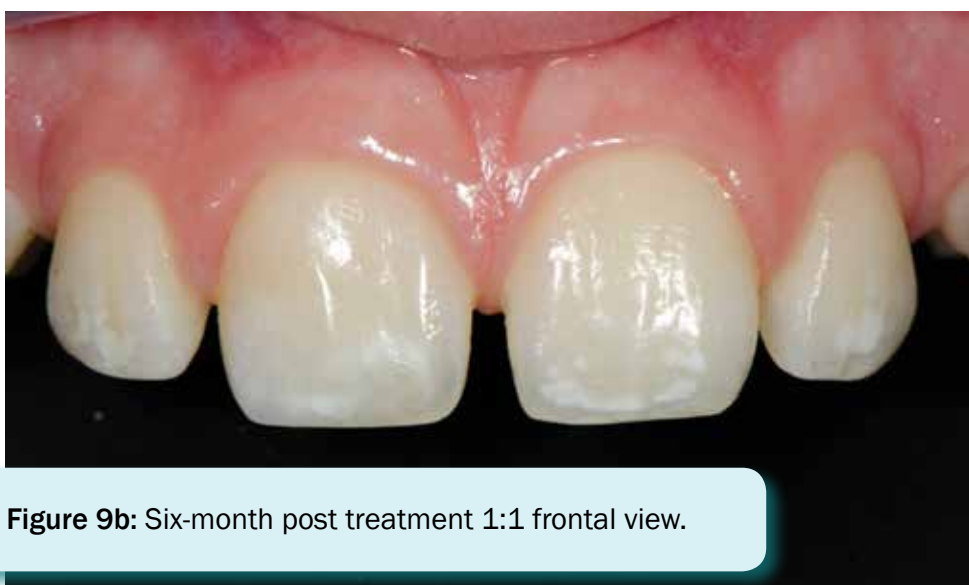
Figure 9b: Six-month post treatment 1:1 frontal view.