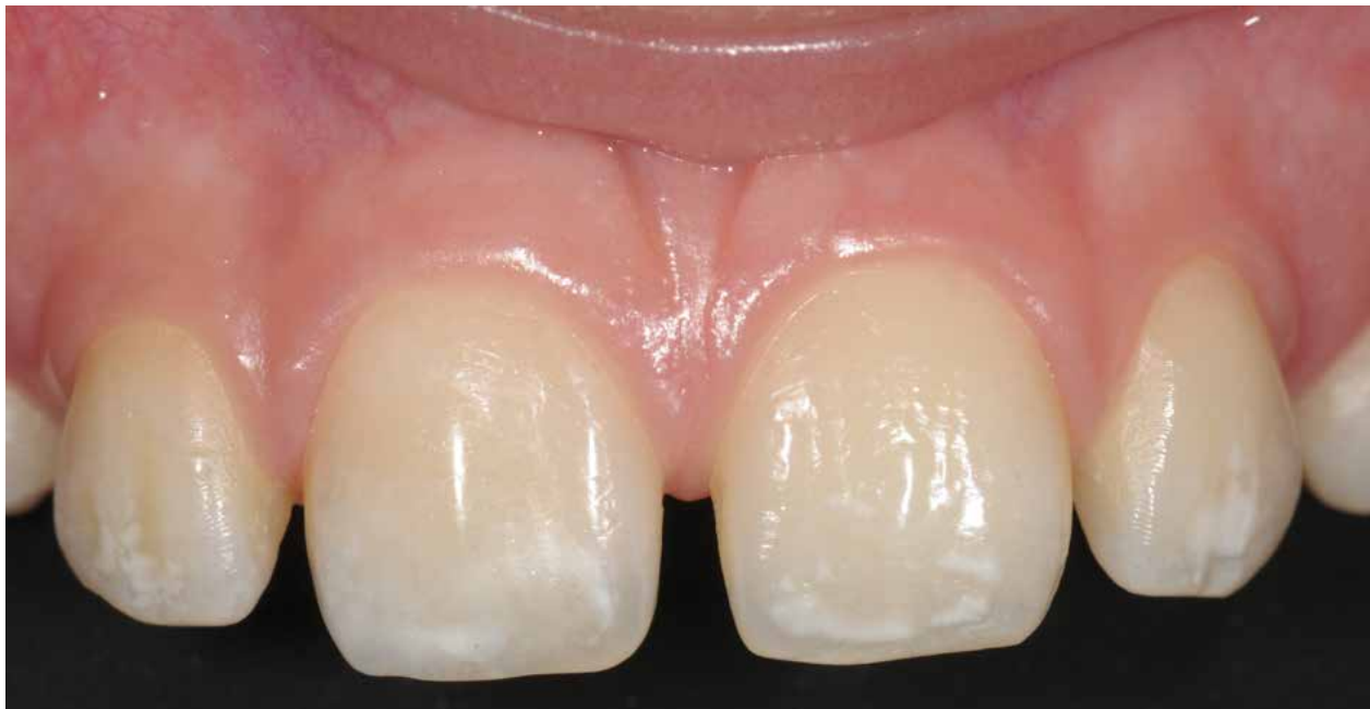
Figure 7: In the “after” 1:1 frontal view, the translucency, halo, and whitish, opaque enamel hypoplasia effects create a lifelike mirroring of the adjacent central incisor.

POLISHING. The proximal surface was polished using a finishing diamond strip (NTI-Kahla GmbH; Kahla, Germany). Facial and palatal surfaces were modeled with ultra-fine diamonds (LT2, 7406, Shofu). Static and dynamic occlusion was optimized using articulating film (TrollFoil, Trollhätteplast AB; Trollhättan, Sweden). All surfaces were polished using polishing points (Enhance, Dentsply) and FlexiDiscs (Cosmedent). Before the final polishing, the restoration was covered with a layer of “air-block” water-soluble glycerin (Glycerigel, Ivoclar Vivadent). Final polymerization was carried out with 20-second cycles on the palatal and facial surfaces to obtain the maximum monomer conversion in the uppermost layer of composite material, normally inhibited by oxygen. 9 A FlexiBuff disc with Enamelize paste (both Cosmedent) was used to obtain the final gloss (Fig 7).