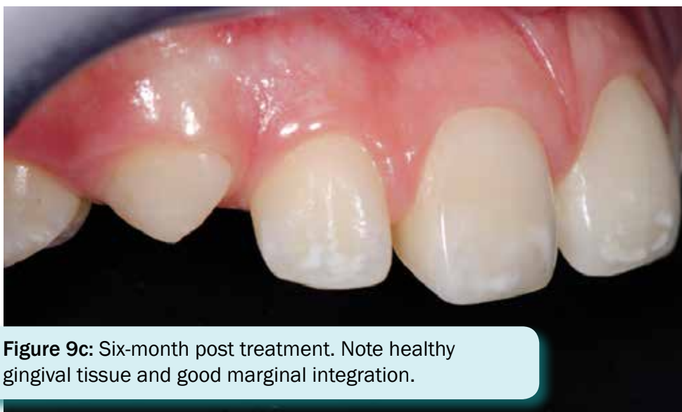
Figure 9c: Six-month post treatment. Note healthy gingival tissue and good marginal integration.