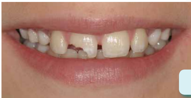
Figure 3: Preoperative 1:2 full natural smile view.