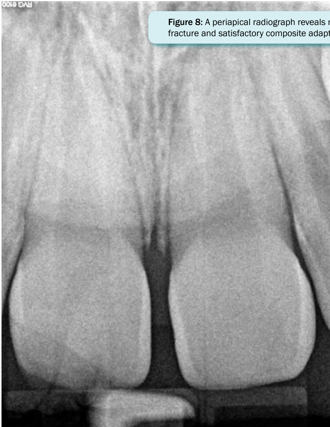
Figure 8: A periapical radiograph reveals no root fracture and satisfactory composite adaptation.

FINAL CHECK. The patient was given home care instructions and scheduled to return three days later for a final check of function and esthetics, and to complete photographic and radiographic documentation (Fig 8). He was invited for posttreatment photography six months later (Figs 9a-9c).